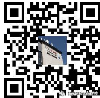
Virtual Open House Registration 云探校报名二维码