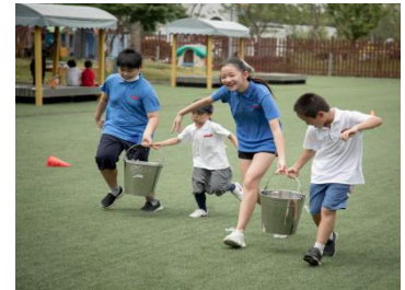
Wonderful Moments of the Sports Day 运动会精彩瞬间