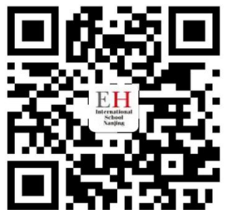
SINA WEIBO Official Account 新浪微博官方账号