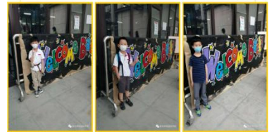
The first Day of our PYP1 students PYP1年级的学生们第一天返校