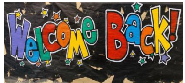
Our Welcome Wall 我们的『欢迎』墙