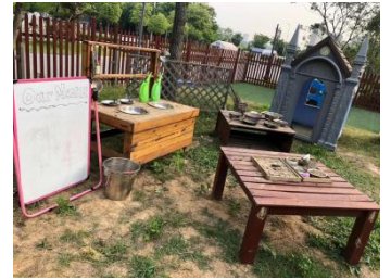
Our Outdoor Provocations 我们的户外『挑战』