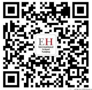
Wechat Official Account 微信公众号