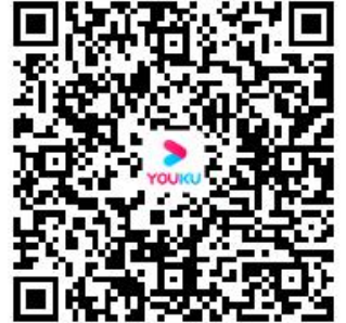
Virtual Tour Video 云探校视频（扫码即可观看哦） Password 密码：123456