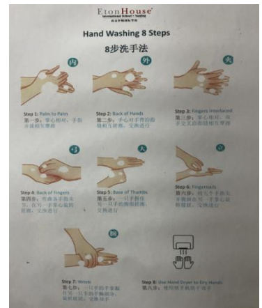
Our Hand Washing 8 Steps 我们的八步洗手法