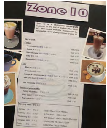
Menu and fee details for Zone 10 coffee shop 第十区咖啡店的价目表

非常感谢各位的支持和鼓励，这对于学生们而言十分重要。请注意第十区咖啡店是非盈利项目，等到明年五月份这个项目结束后，除去开支之外的所有盈利将会归于慈善机构。