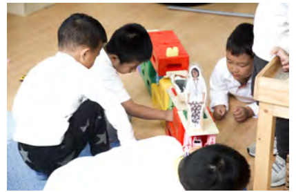
EY3 students in class 课堂里的中班学生