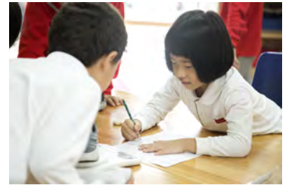
PYP23 class students 课堂上的二三年级学生

家长们会在下周收到老师发来的家长会议的时间表，请用这次会议的时间和学生的主班老师，课程老师们沟通关于学生的学习，以及如何让老师们更好的支持他们的学习。