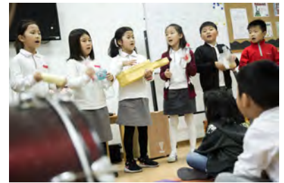
PYP23 students in music class 二三年级学生在音乐课上