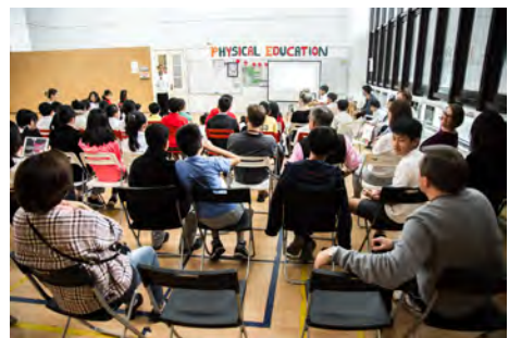
Assembly in Gym 每周在体育馆举行的周会